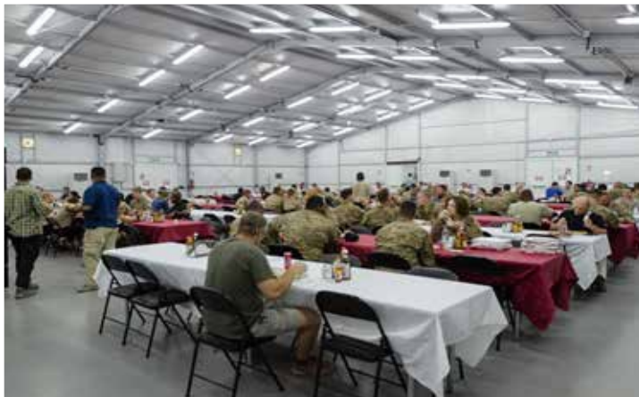
We constructed and manage a $2.6M, 22k sq. ft. dining facility in Erbil serving an average of 59,000 meals each month.

KBRwyle continues to provide support to the U.S. Army combatant commands during contingency operations for Operation Inherent Resolve at six sites in Iraq and nine sites across Kuwait and the UAE. Support includes base operation and maintenance, and general construction services spanning 80 services requirements, supporting a population over 8,000 on a 24/7 basis.